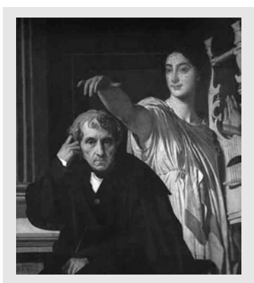
Luigi Cherubini and the Muse of Lyric Poetry by Jean Auguste Dominique Ingres (1842). The crowning Muse displeased Cherubini and is blacked out in some copies.

(8 or 14 September 1760 – 15 March 1842)