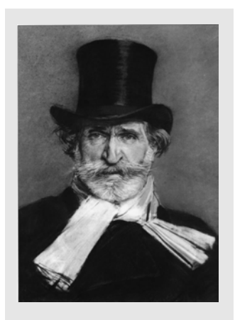
Portrait of Verdi by Giovanni Boldini (1886). This famous portrait was the main inspiration for Luchino Visconti in creating the character played by Burt Lancaster in his film The Leopard.

Verdi is probably the most popular composer in the 400-year history of opera. But, not being particularly religious, he did not write a great deal of sacred music. Before the Quattro Pezzi Sacri he had written only the great Requiem (1874) and the Libera Me (1868).